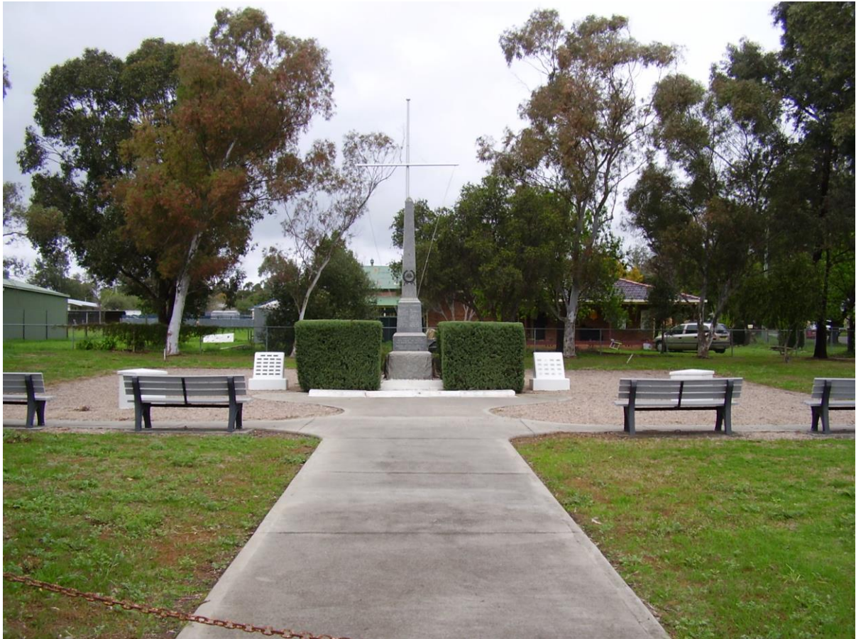
Merriwa War Memorial