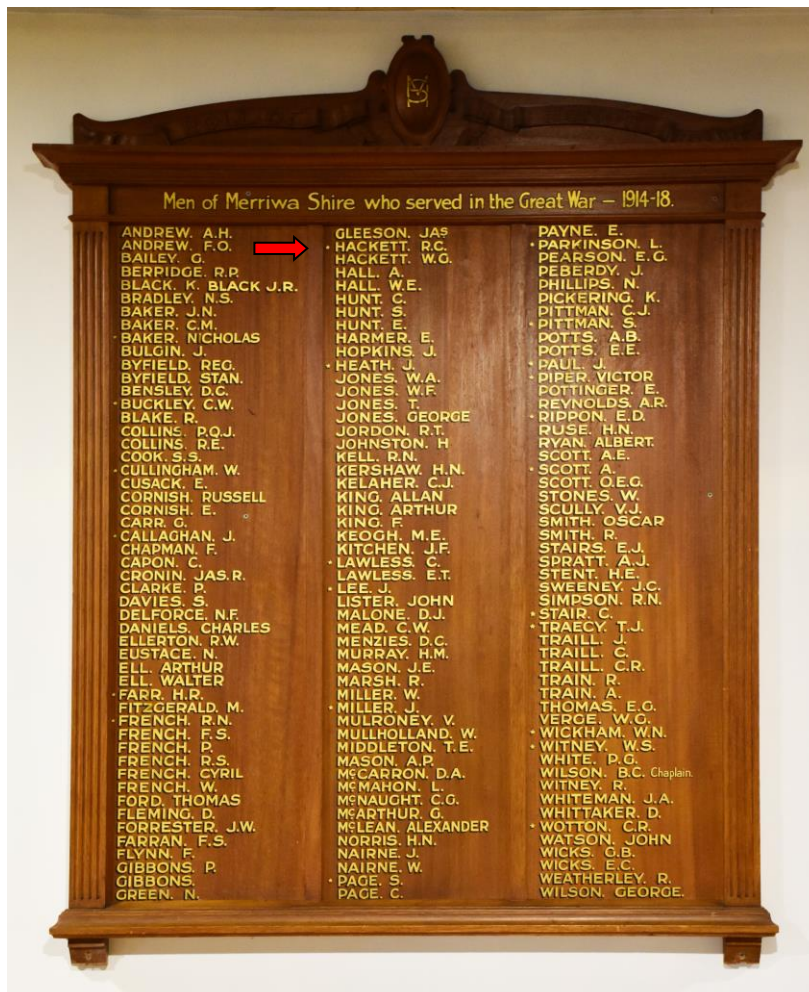
Men of Merriwa Shire Honour Roll